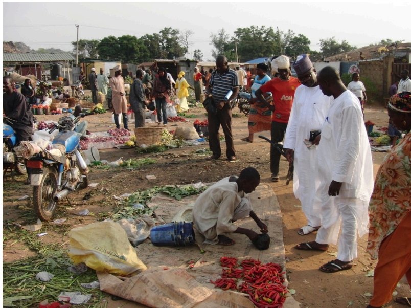
COREN WEBINAR SERIES 2020