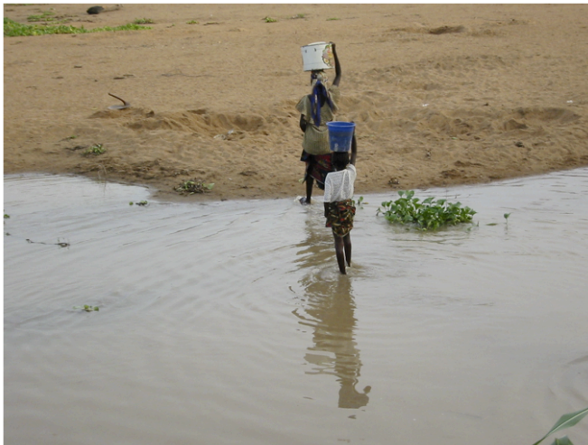
COREN WEBINAR SERIES 2020