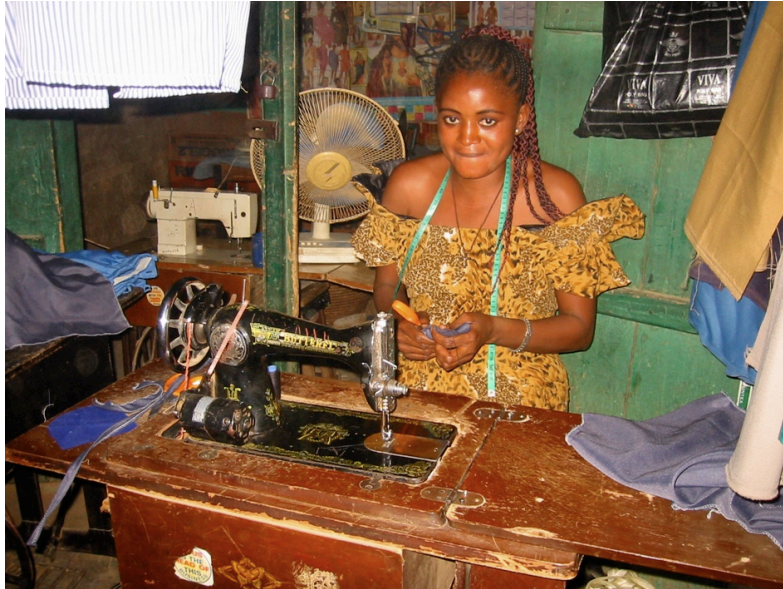
COREN WEBINAR SERIES 2020