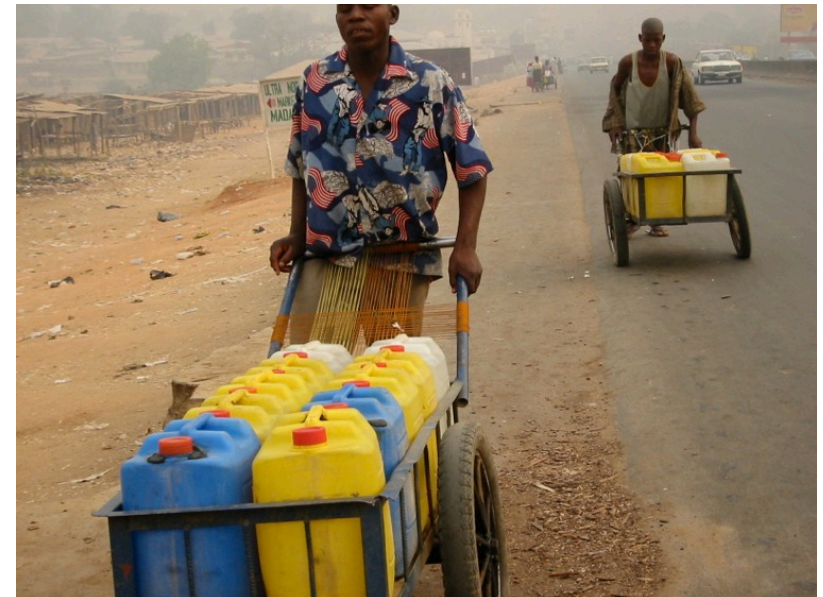
COREN WEBINAR SERIES 2020