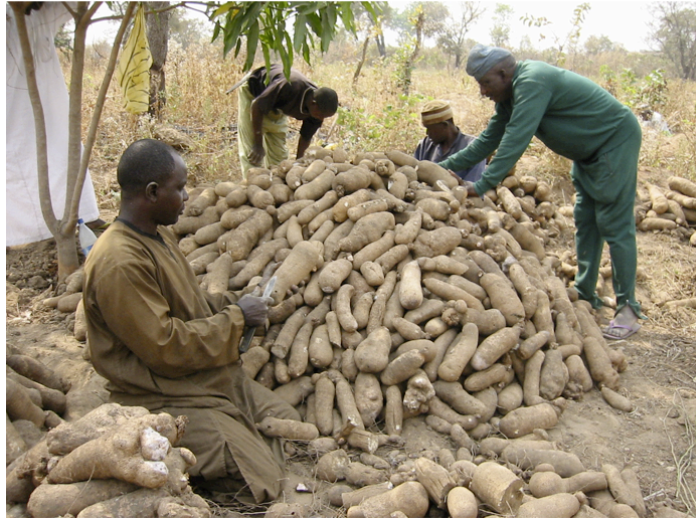
COREN WEBINAR SERIES 2020