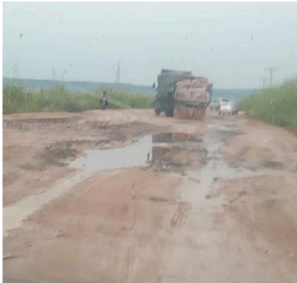
COREN WEBINAR SERIES 2020