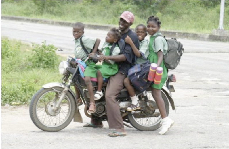
COREN WEBINAR SERIES 2020