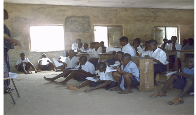
COREN WEBINAR SERIES 2020