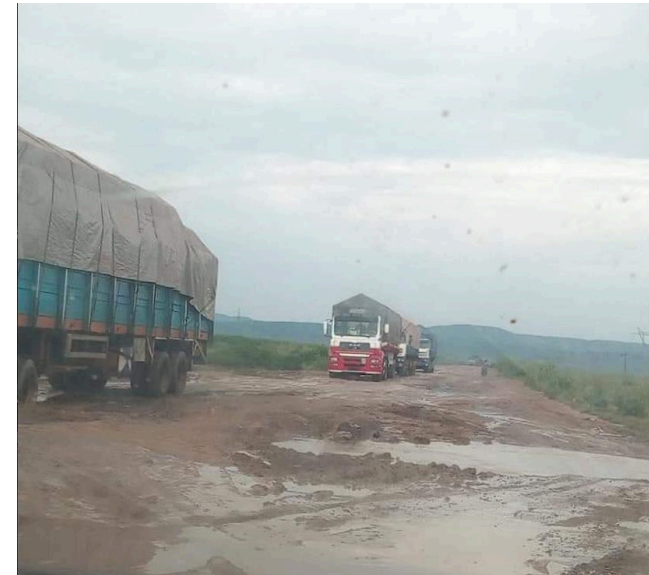
COREN WEBINAR SERIES 2020