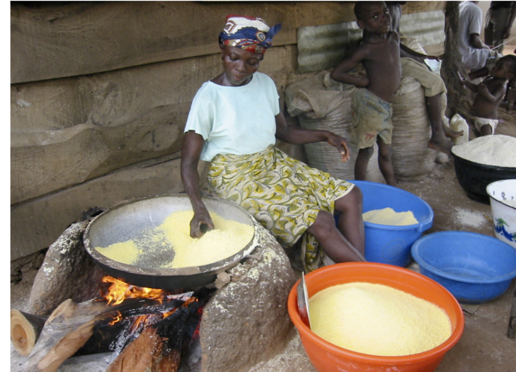
COREN WEBINAR SERIES 2020